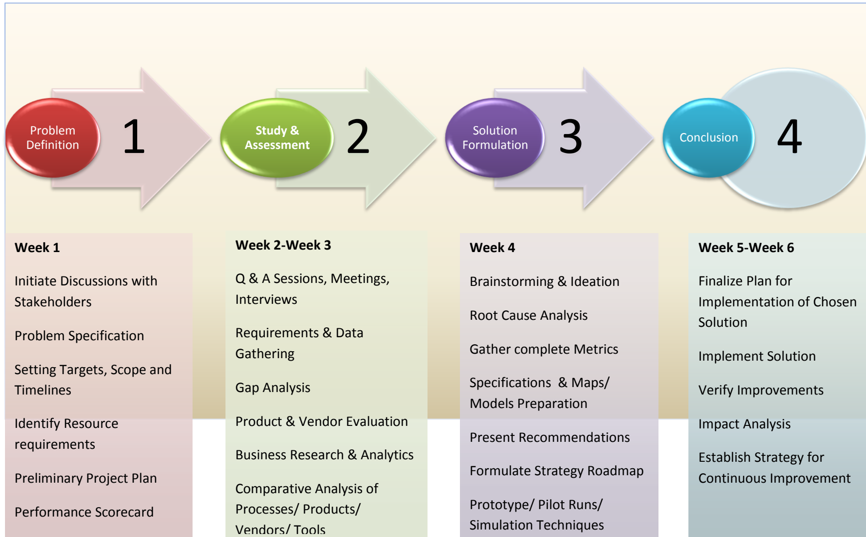
Figure 1: Rapid BA Cycle